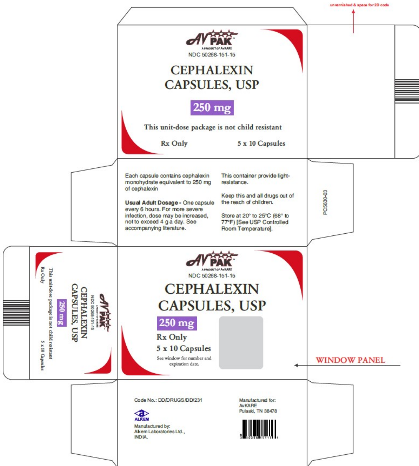
PACKAGE LABEL.PRINCIPAL DISPLAY PANEL